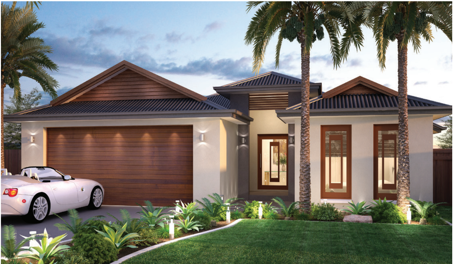
The Parkway, East at Banora